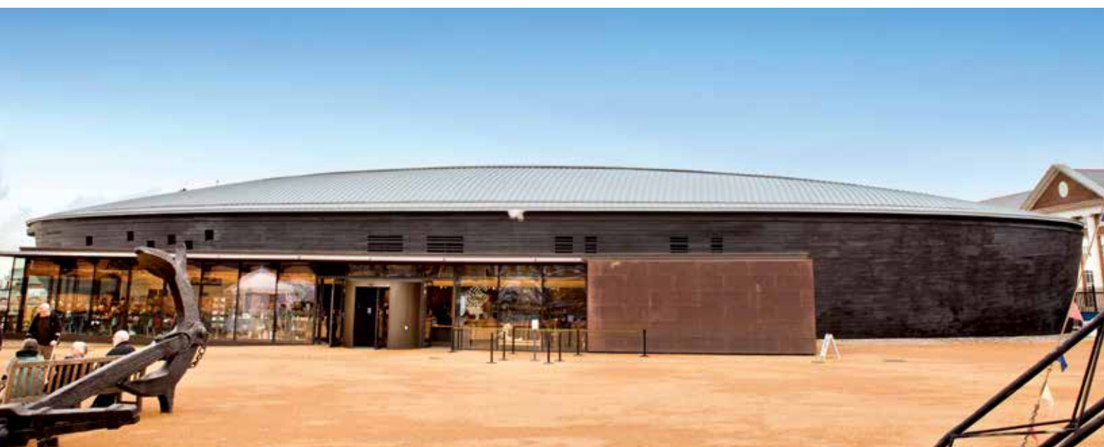
Mary Rose Museum, UK