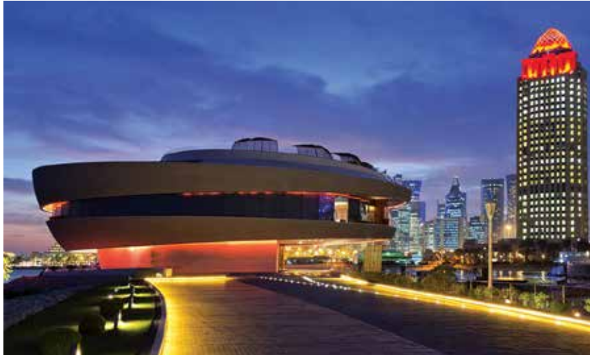
Nobu Restaurant, Qatar

With a wide technical know-how and company-owned manufacturing facilities in Greece, Serbia and China, KLEEMANN caters to the needs of the global market through constant use of state-of-the art mechanical equipment built according to its high safety standards.